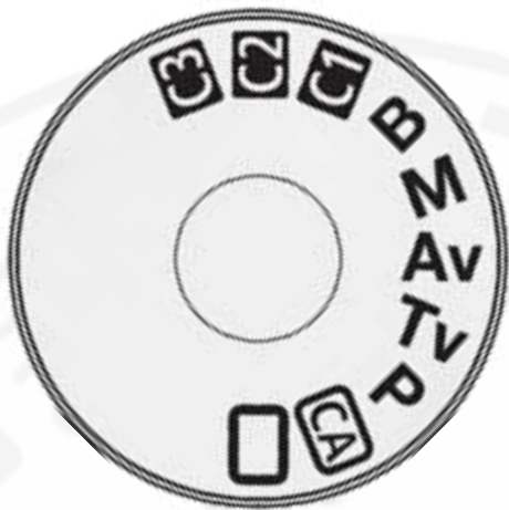
FIG 1: Nikon Mode Dial