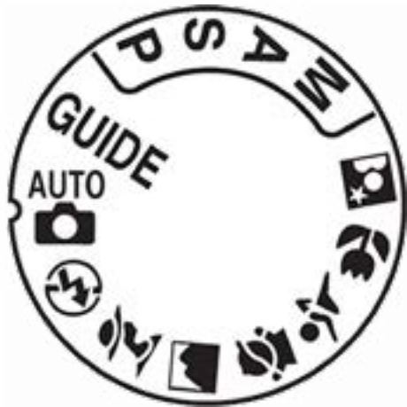
FIG 2: Canon Mode Dial